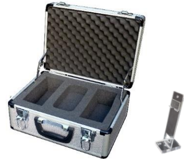
Table stand for IC-Meter

Acrylic stand to put on a table/shelf or wall hanging.